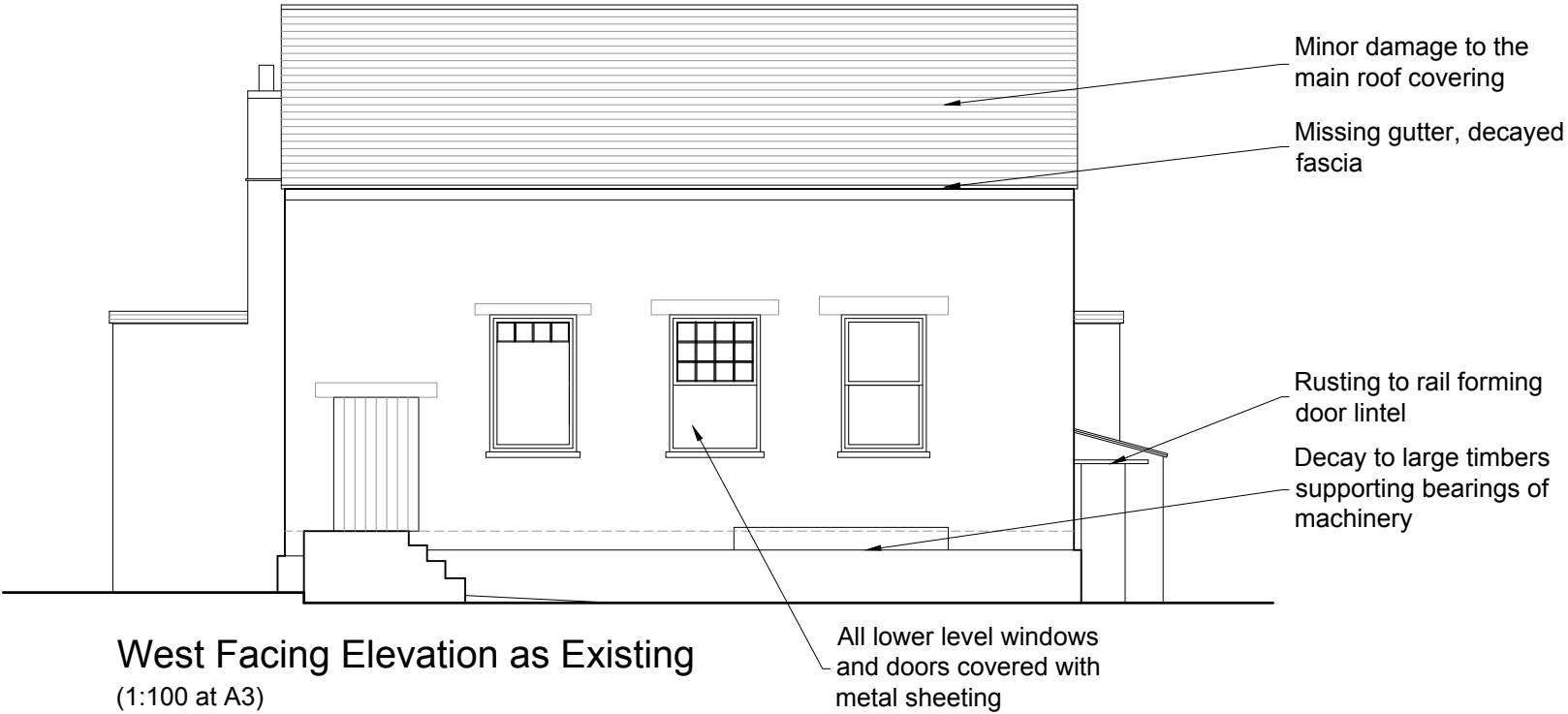
West Facing Elevation as Existing (1:100 at A3)