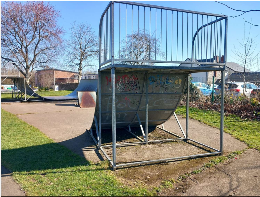
Existing Skate Ramps