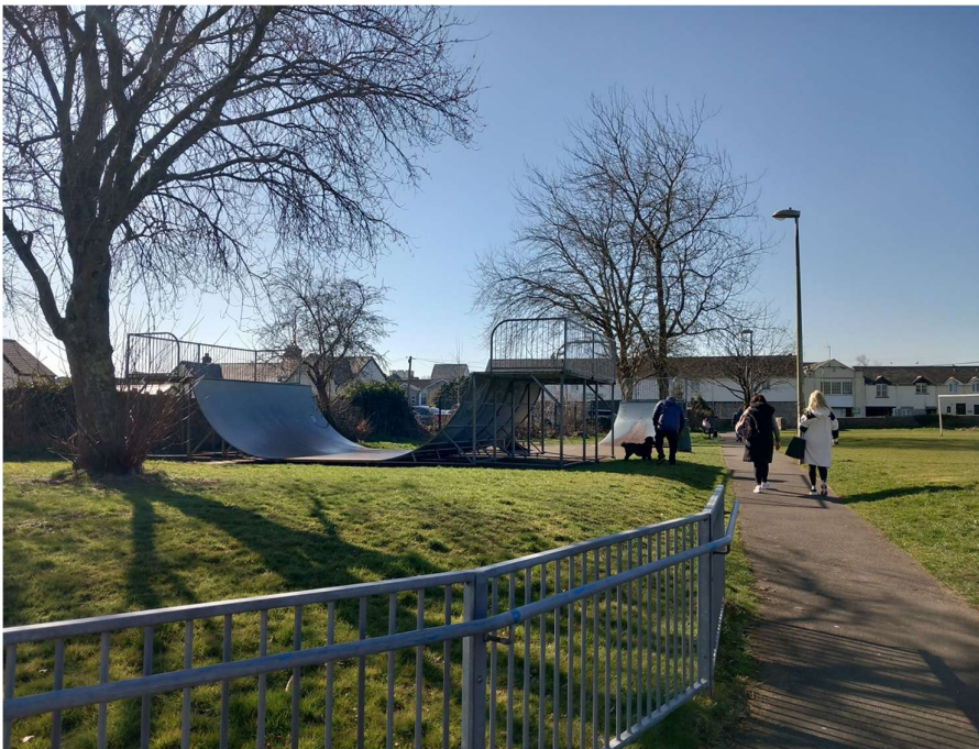
Existing Skate Ramps