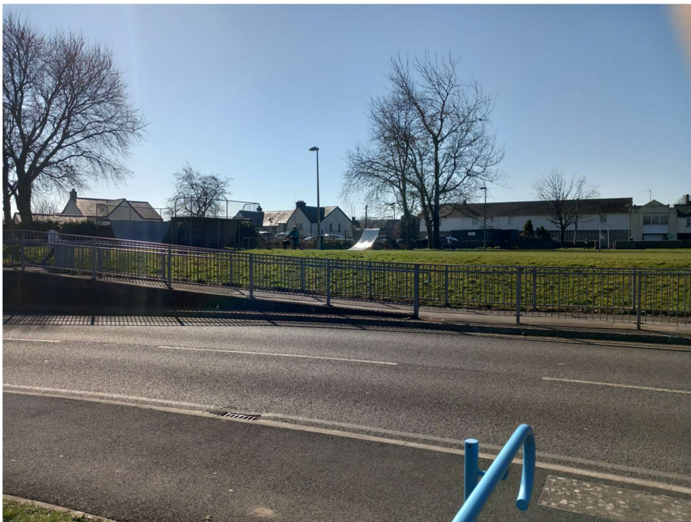
Bearfield Skate Park – Pedestrian access to site.