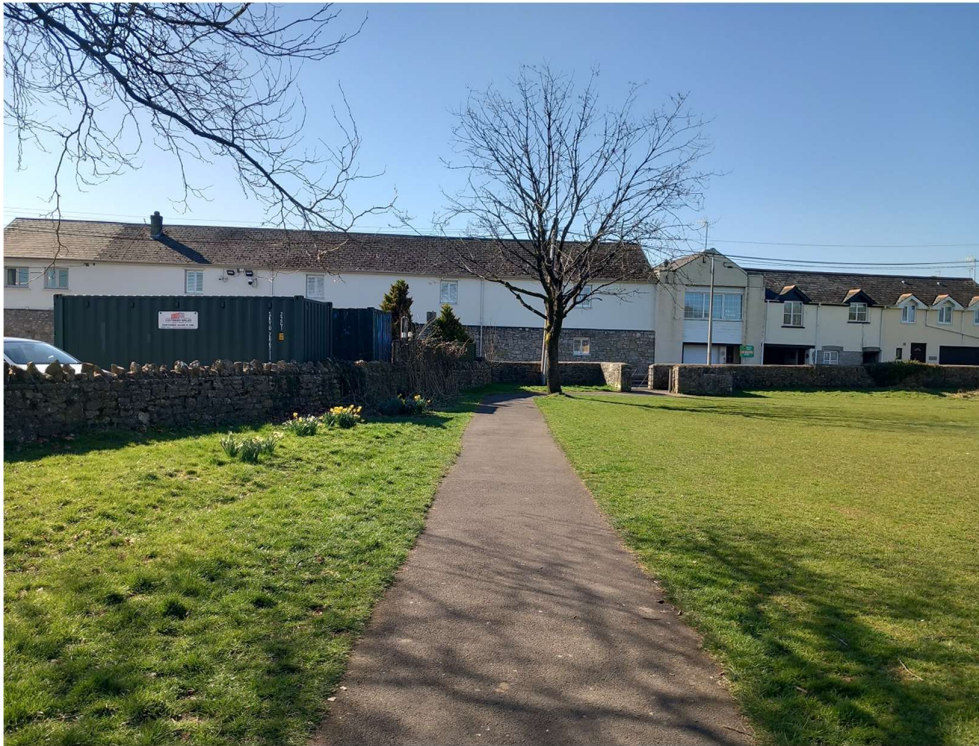
Bearfield Skate Park - Pedestrian access to site.