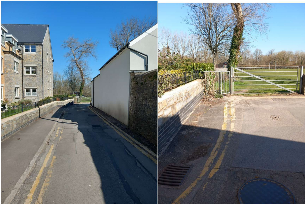
Potential Restricted Vehicular access from Eagle Lane