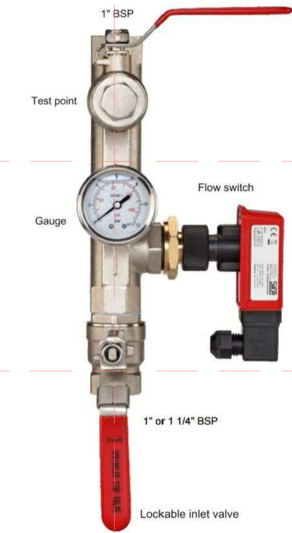
SPRINKLER VALVE SET DETAIL

DESIGN SPECIFICATION: FIRE SPRINKLER SYSTEM HAS BEEN DESIGNED TO BS9251:2014 VARIATIONS - N/A HYDRAULIC DESIGN INFORMATION: CATEGORY OF SYSTEM - 1 TYPE OF OCCUPANCY - INDIVIDUAL FLATS NUMBER OF DESIGN SPRINKLERS - 2 DESIGN DENSITY - 2.04 MM/LIN SPRINKLER K FACTOR - 3.0 & 4.9 MINIMUM FLOW RATE - 30.3 LPM & 49.2 LPM MINIMUM PRESSURE - 0.49 BAR & 0.48 BAR DESIGN SPACING - 3.7m x 3.7m & 4.9m x 4.9m FHC DATA: MOST UNFAVOURABLE - TBC MOST FAVOURABLE - TBC WATER STORAGE TANK INFORMATION: REQUIRED EFFECTIVE CAPACITY - N/A ACTUAL EFFECTIVE CAPACITY - N/A TANK MANUFACTURER - N/A TANK PART NUMBER - N/A REDUCED CAPACITY TANK UTILISED - N/A REQUIRED PROVEN RATE OF INFILL - N/A ACTUAL PROVEN RATE OF INFILL - N/A REDUNDANT PIPE/TANK FEED REQUIRED - N/A FIRE PUMP INFORMATION: MANUFACTURER - GRUNDFOS PUMP MODEL - TBC