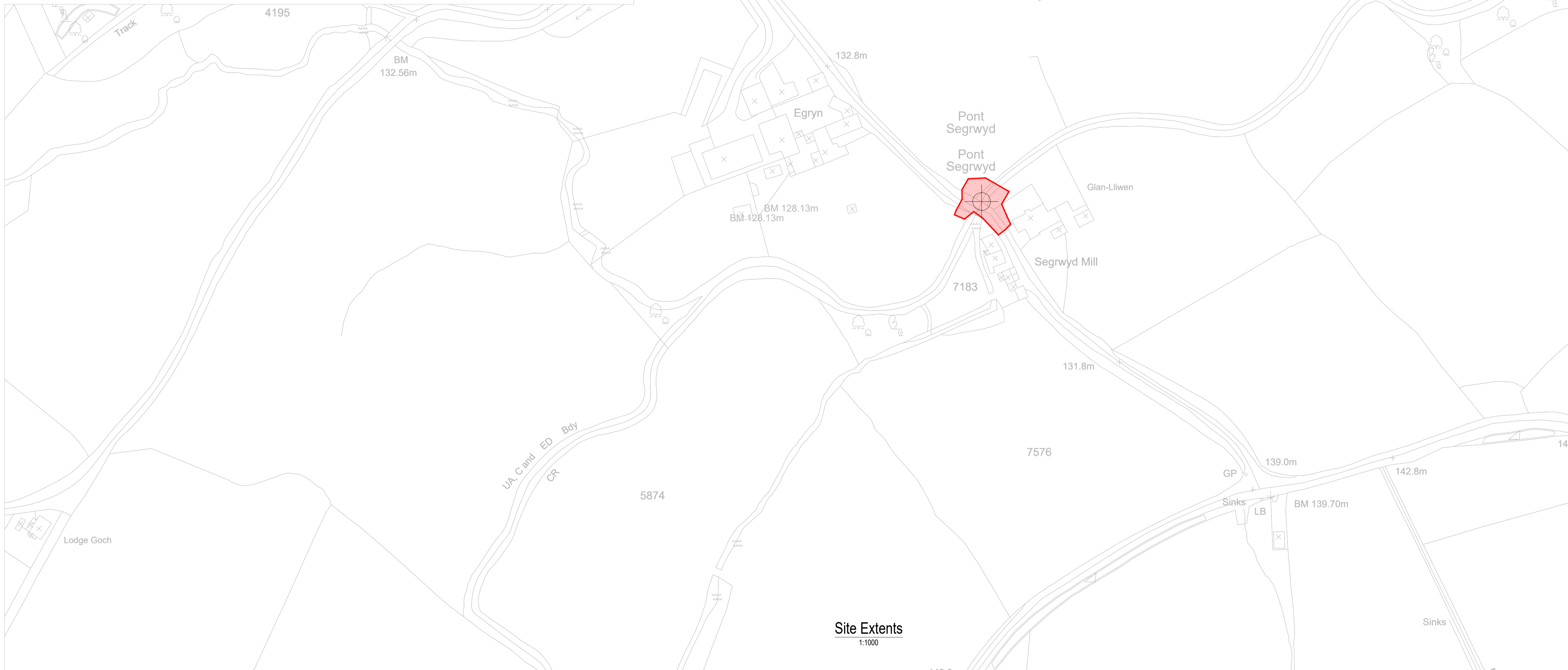
Site Extents 1:1000